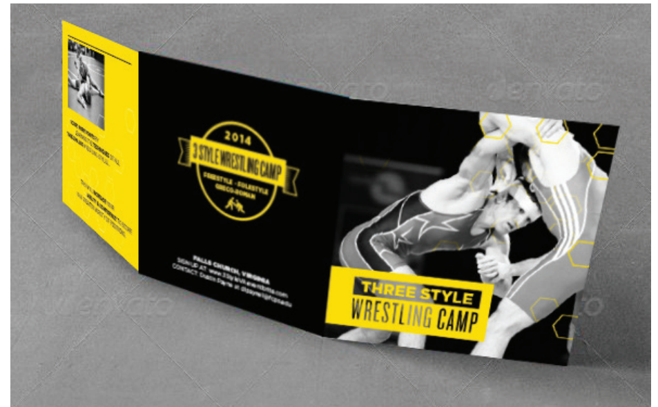
5X5 SQUARE TRIFOLD ON THICK PAPER